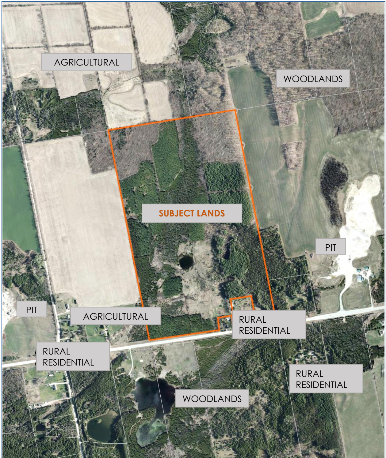
Figure 1: Subject Lands and Surrounding Lands