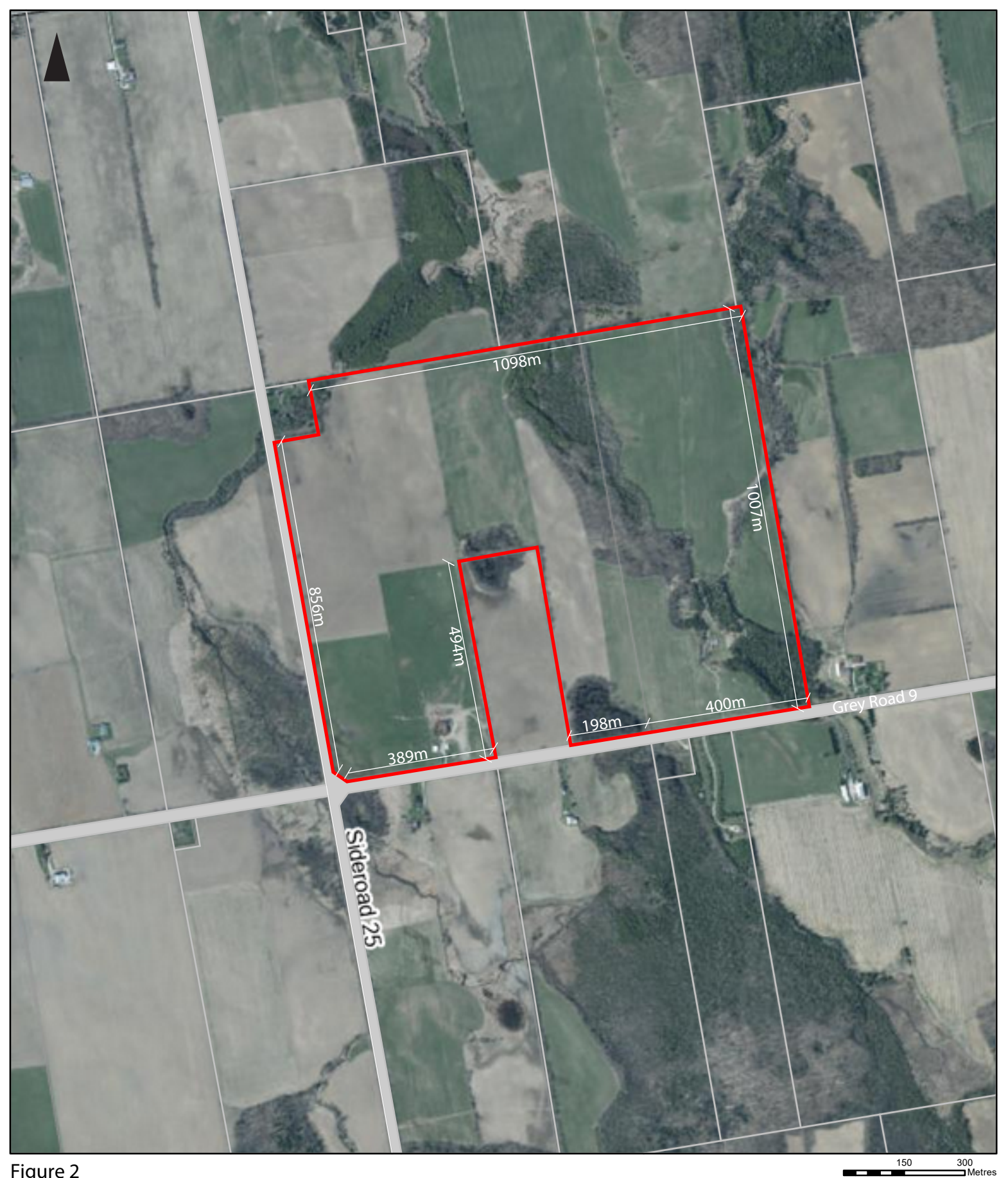
Figure 2 Subject Lands - Aerial 142239 Grey Road 9 Municipality of West Grey