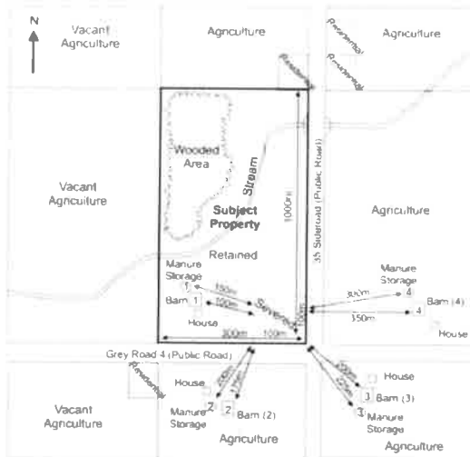
Example Drawing 1 – General Area